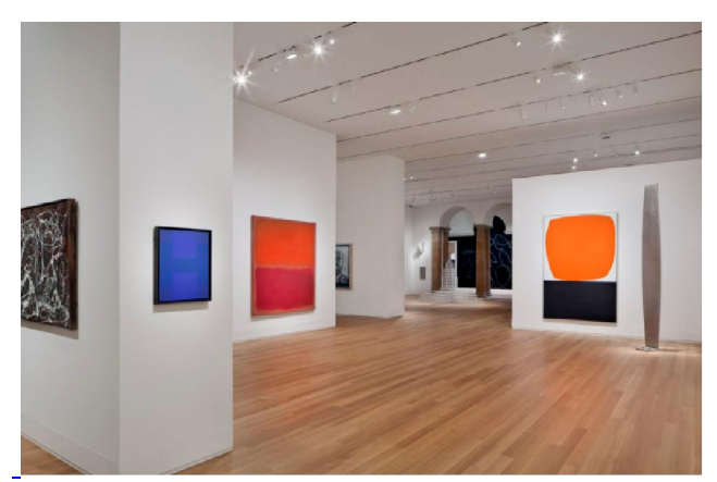
Gallery.

_Modern and contemporary art galleries, Yale University Art