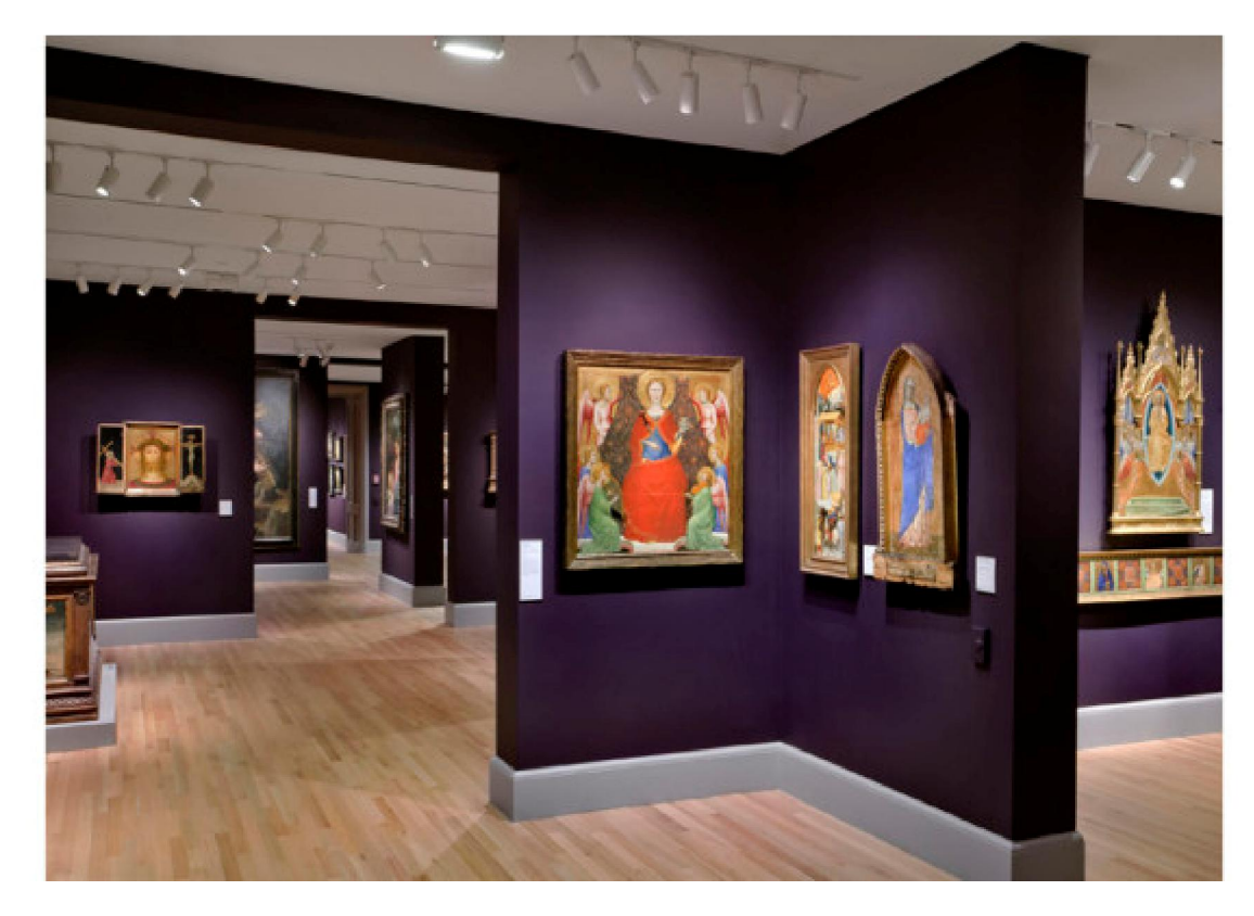
_European art galleries, Yale University Art Gallery.