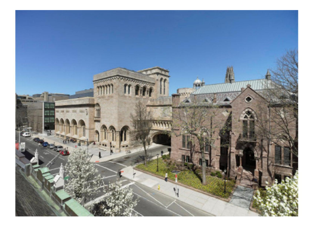
Exterior view of the Yale University Art Gallery, (left to right: Louis Kahn building, Old Yale Art Gallery building, Street Hall).