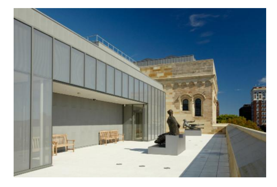
_Sculpture terrace, Yale University Art Gallery. 2012