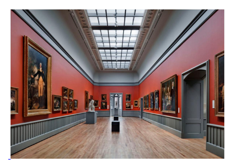
_American paintings and sculpture galleries, Yale University Art Gallery.