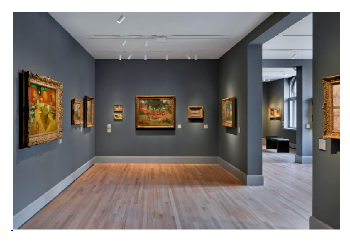
_European art galleries, Yale University Art Gallery.