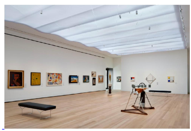
University Art Gallery.

_Special-exhibition galleries in Old Yale Art Gallery, Yale