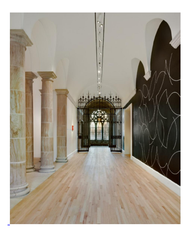
_Restored Yellin Gates, Yale University Art Gallery.